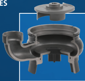
EF: Open single-vane impeller