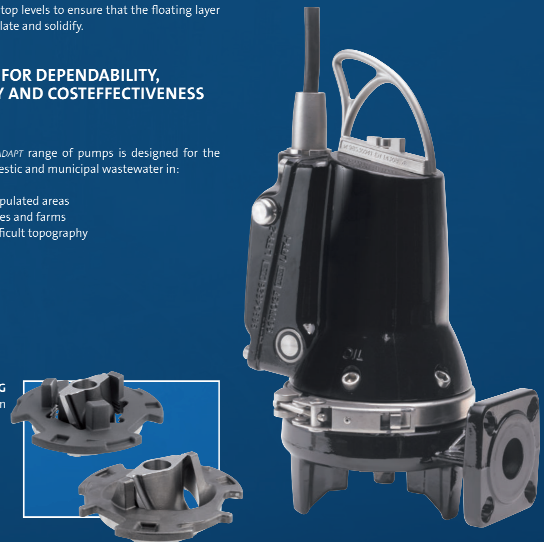
SEG Cutter System

The Grundfos patented grinder system ensures the reliable and efficient grinding of solids to even smaller pieces. In addition to extremely effective and reliable operation, service is easy, with quick dismantling for replacement of wear parts requiring no special tools.