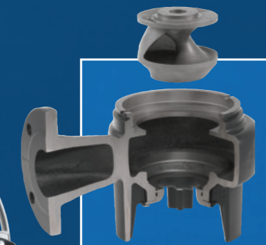
SL1: Single-channel impeller