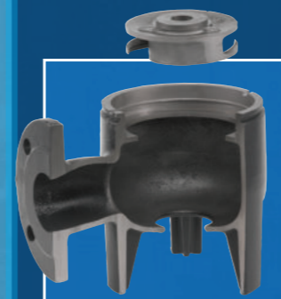
SLV: SuperVortex impeller

The SLV pumps range has a SuperVortex impeller and is ideal for liquids with a high concentration of solids, fibres, or gassy sludge, while the SL1 pumps range has a single-channel impeller and is ideal for large flows of raw sewage.